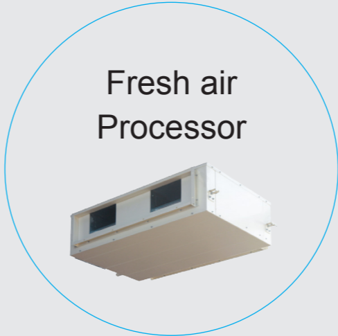
Fresh air Processor